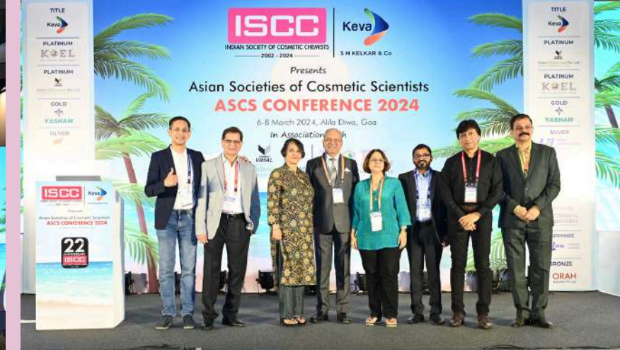
Asian Societies of Cosmetic Scientists ASCS CONFERENCE 2024 6-8 March 2024, Alila Diwa, Goa